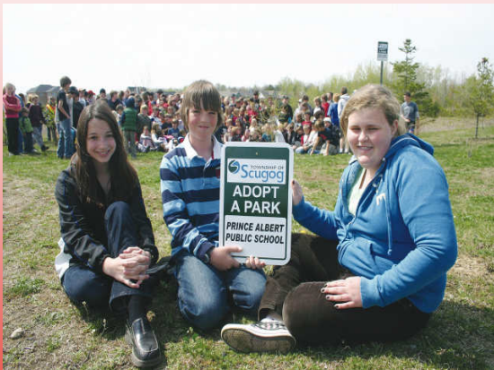
Prince Albert Public School, May 2008

The program is an effective way for environmentally conscious individuals and community groups to show their civic pride by contributing to a cleaner and more scenic park system.