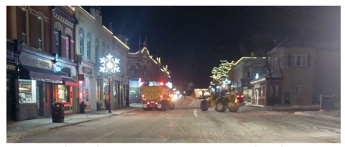
Township Crews Out in the Early Morning Hours to Clear Snowbanks